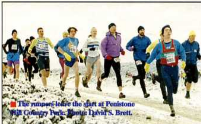
■ The runners leave the start at Penistone Hill Country Park.

Auld lang Syne Fell Race, Keighley, W Yorks, December 31