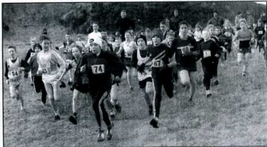
THEY'RE OFF: Competitors at the start of the junior race